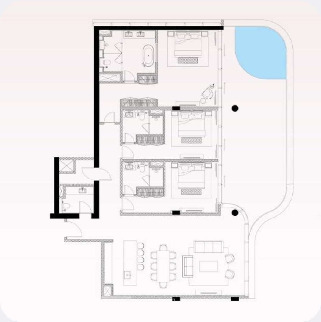
Apartments 3 bedroom