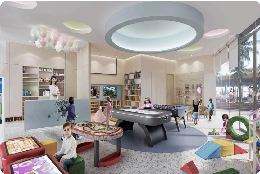
KIDS CLUB Visualisation from developer