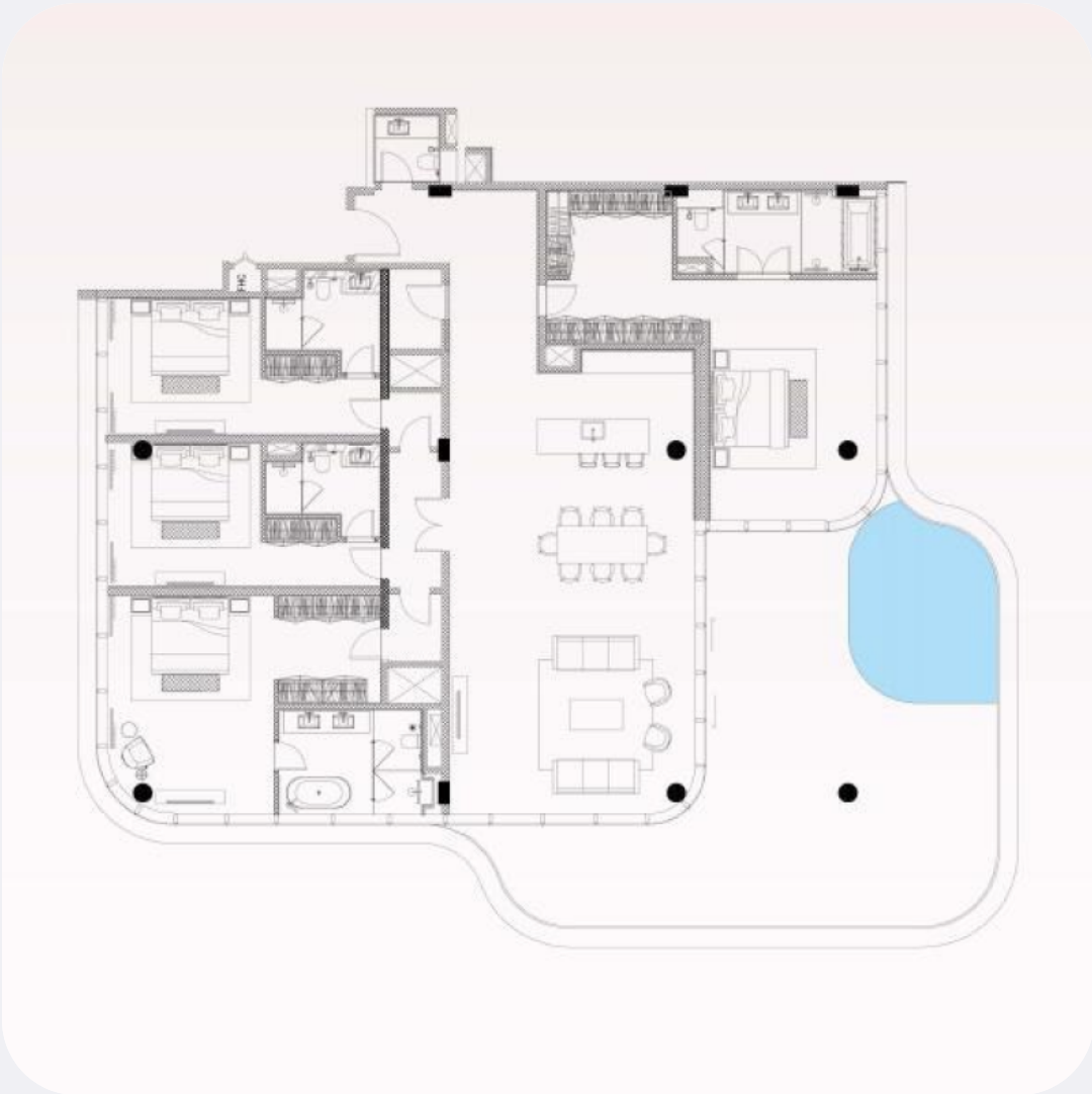
Apartments 4 bedroom