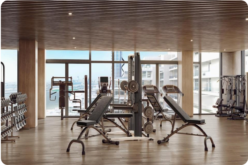
GYM Visualisation from developer