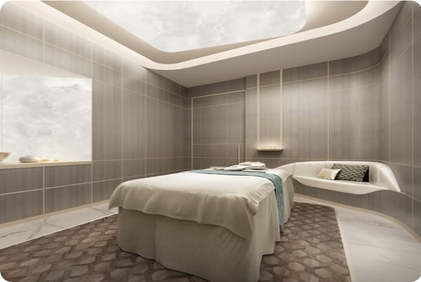
SPA Visualisation from developer