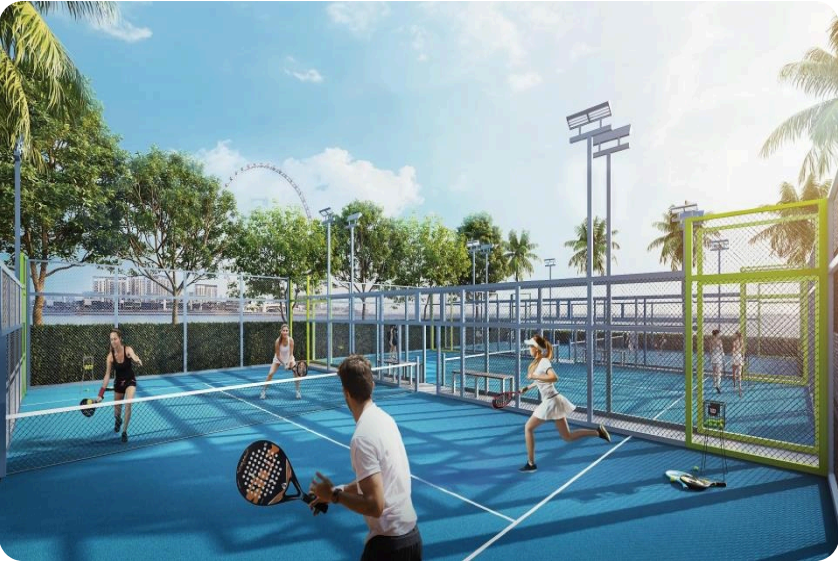
PADDLE COURT