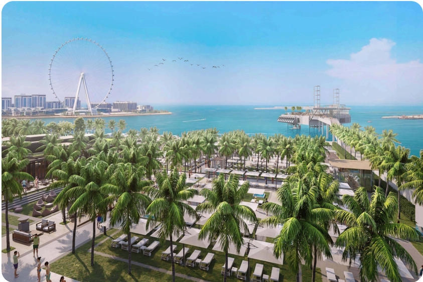
PRIVATE BEACH Visualisation from developer