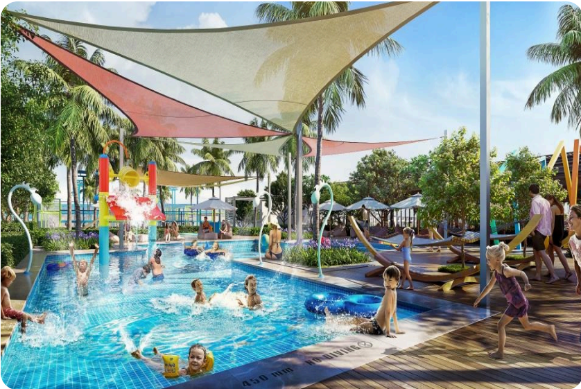
KIDS POOL Visualisation from developer