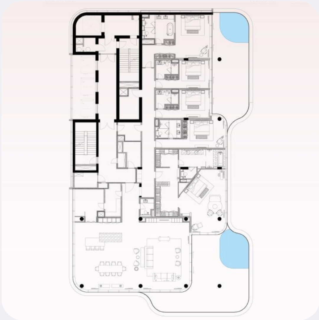
Apartments 5 bedroom