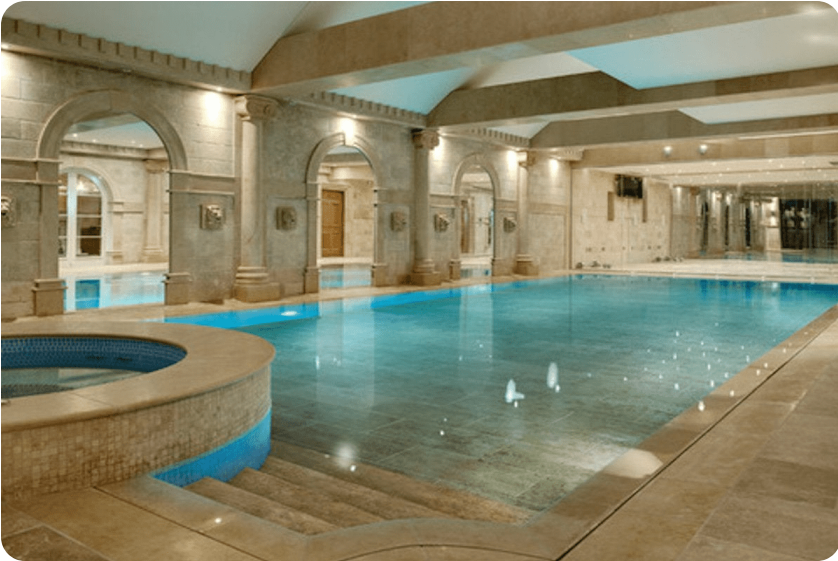
INDOOR POOL Image for general understanding